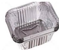
CLEAN FOIL PANS